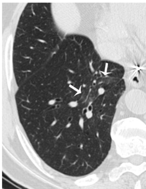
Figure 2. Unenhanced Chest CT Scan of a 76-Year-Old Asymptomatic Man with COVID-19. Note: Coned down view of the right lower lobe (lung windows) demonstrates minimal ground glass opacities (arrows), perhaps the result of the documented recent viral infection.

Abbreviations: CT, computerized tomography; RT-PCR, reverse transcription polymerase chain reaction.